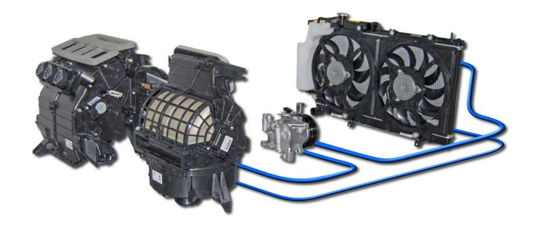
AIR CONDITIONING LOOP SYSTEM